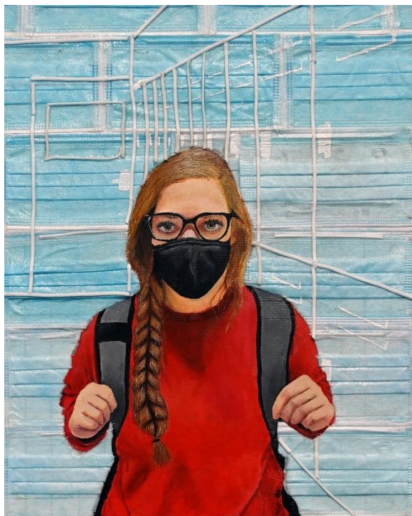
Previous Best in Show: