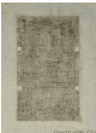
Property of the TMA