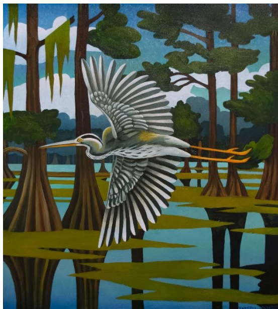
The Art of Texas State Parks

The Art of Texas State Parks exhibition showcases a selection of artworks depicting different Texas State Parks. Artists from across the state captured iconic views of the varied Texas landscape. These works often include wildlife, visitors, and human structures built within the parks. The exhibition serves to celebrate the rich environments and ecosystems of the state.