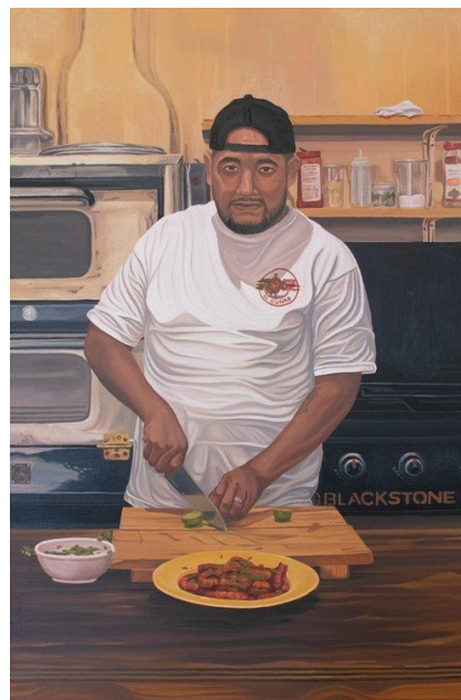
Forward Facing: A Look at Contemporary Portraiture

For information on the artwork, click here!