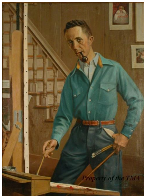
At 55: Tyler Museum of Art's Legacy

Information about the artwork: click here!